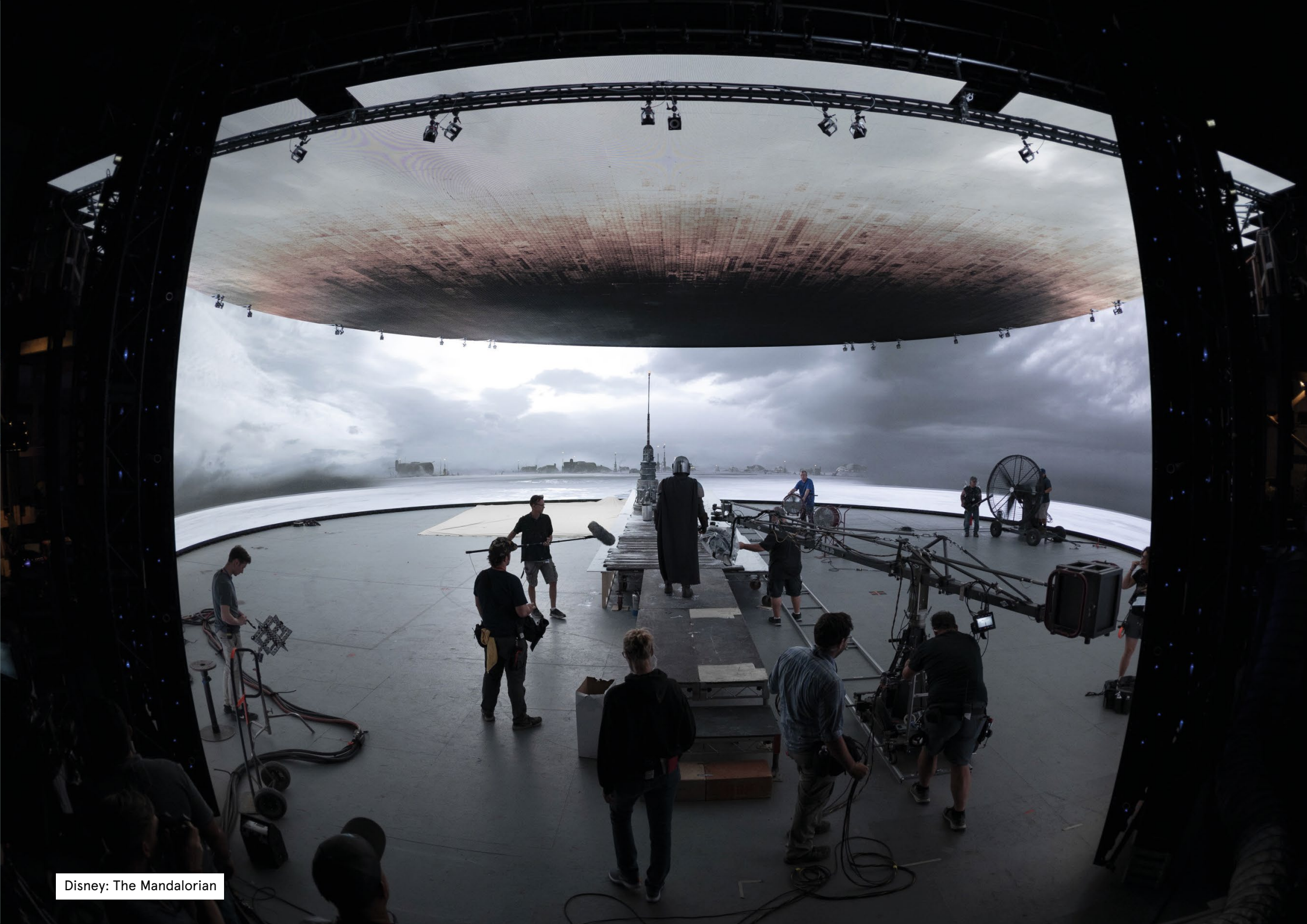
Disney: The Mandalorian