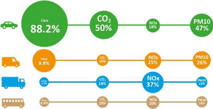
Image 2.7: Proportion of vehicles in traffic and emissions (Rotterdam city centre, 2015) 9